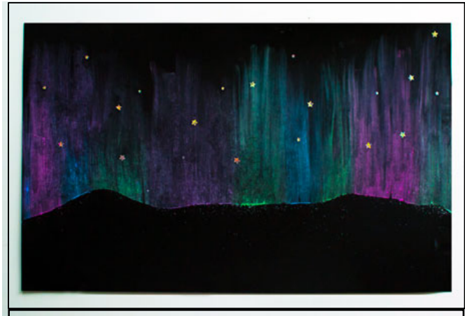
Credit to CBC https://www.cbc.ca/parents/play/view/how-to-draw-the-dancing-northern-lights

The final product should look something like this!