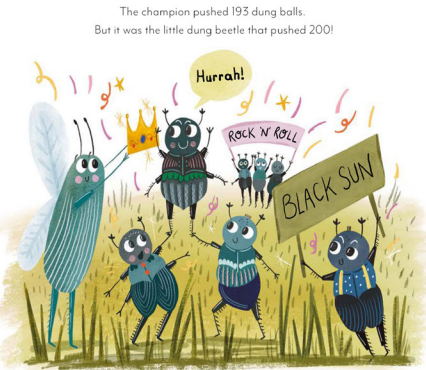
The stadium cheered loudly, 'New Black Sun! New Black Sun!